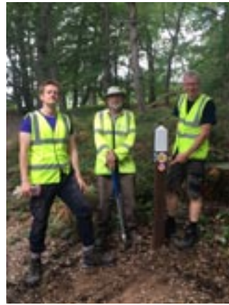
Another was installed at the junction of Footpath 56 and Bridleway 13 in Lingwood Common.

A No Cycling sign has been rescued from the undergrowth on Footpath 17 and a way marker post has been discovered in dense vegetation at the beginning of Bridleway 49! More posts are to be installed later in the year on Footpaths 1 and 11.