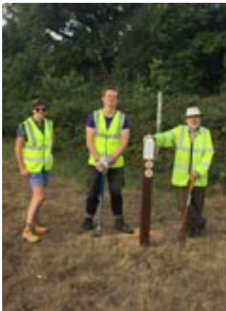
One post was installed at the cross road junction of Footpaths 5,7 and 8 within the Outdoor Pursuits Centre.

The group has only been recently formed but we have already installed two way marker posts and cleared a couple of footpath from overgrowing shrubs.