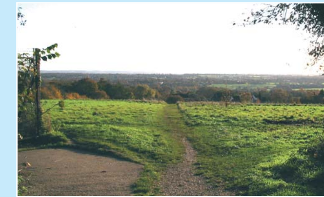
Church Meadow E4