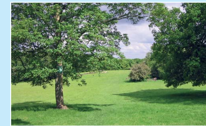
Riffhams Lane D1 to D3