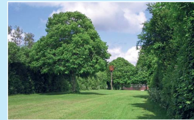
Dawson Memorial Field F3