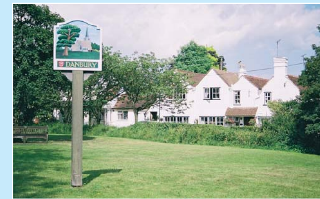
Eves Corner F3