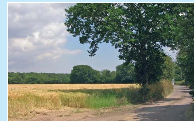
Hyde Chase J6