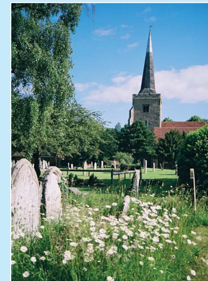
Church of St. John the Baptist E3