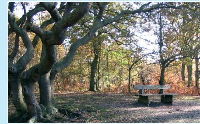
Lingwood Common E1