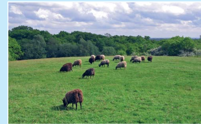
Hitchcock's Meadow Nature Reserve G4