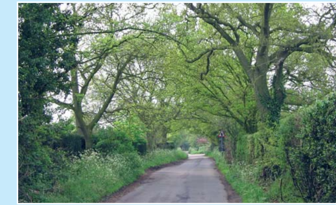
Hyde Lane J3