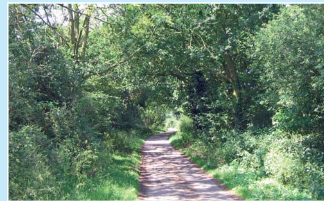
Hopping Jacks Lane G3