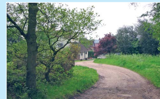
Ludgores Lane E5