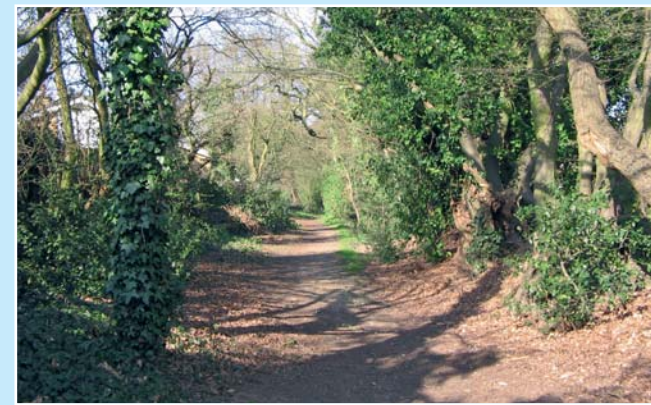
Pedlars Path H3 & H4