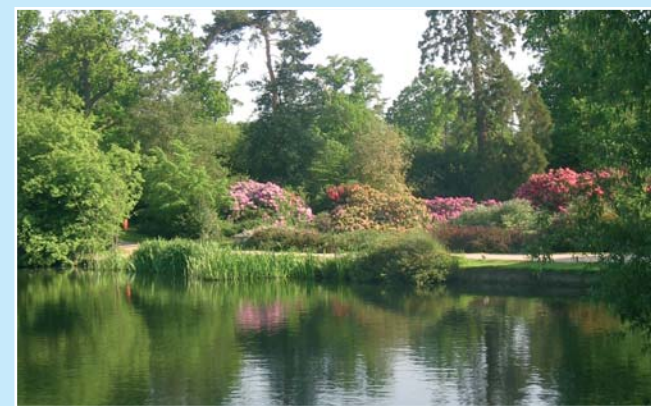
Danbury Lakes C4