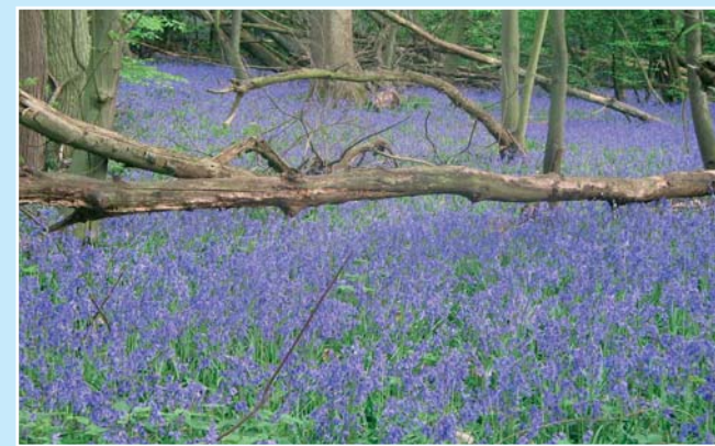
Lingwood Common E1