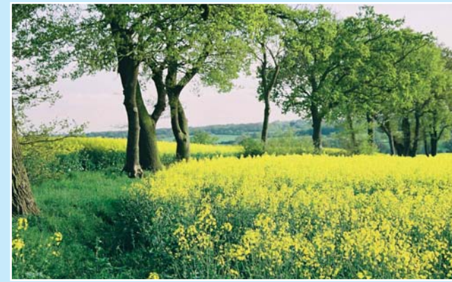
Woodhill Road C5