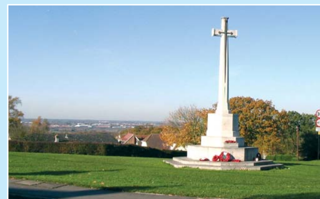
Elm Green War Memorial E3